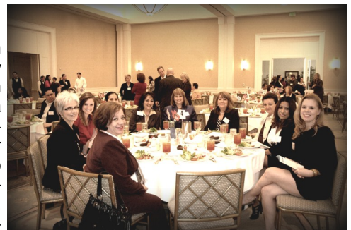
Mary Kay Inc. table at the Igniting Possibilities in Every Kid Luncheon on October 7, 2010.