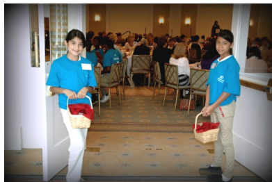
Greeters from our Kids Club Program at Aventerra Apartments